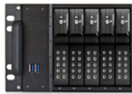
Hot-swap 5 x 3.5" or 5 x 2.5" HDD cage