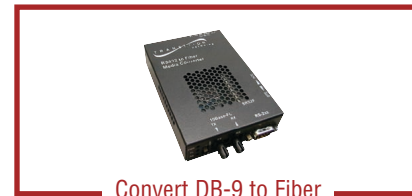
Convert DB-9 to Fiber