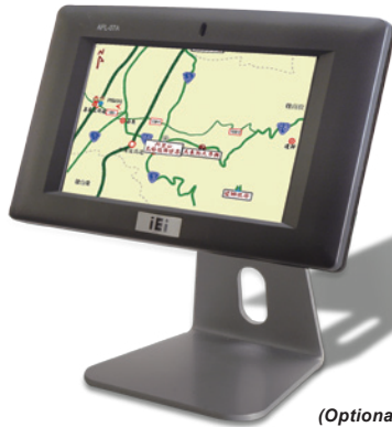
(Optional Stand Kit)