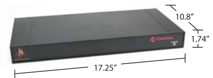
DeviceMaster PRO 16-Port Dimensions