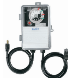
CRSM comes with a timer control package

This powerful agitation allows the use of heavy wettable powers as well as liquid additives to be incorporated into the system. CRSM's are enormously powerful with a pivoting fogging head allowing you to propel the vapor way-up high for superior coverage and circulation. Units produce billions of tiny fog particles for treating greenhouses or similar enclosed areas from 3,000 to 30,000 sq. ft. from a single location. Compact, sturdy and easy to maneuver from location to location, systems are designed for unmanned operation and are supplied with an automatic timer control.