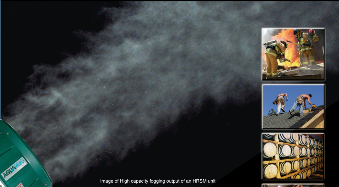
Image of High capacity fogging output of an HRSM unit