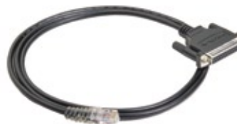
CBL-RJ45F25-150 8-pin RJ45 to female DB25, 150 cm Cable