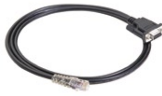
CBL-RJ45F9-150 8-pin RJ45 to female DB9, 150 cm Cable