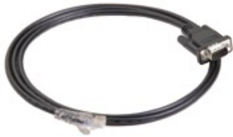
CBL-RJ45M9-150 8-pin RJ45 to male DB9, 150 cm Cable