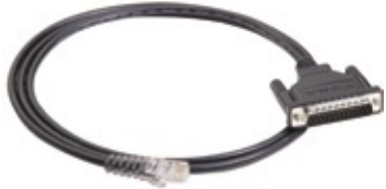
CBL-RJ45M25-150 8-pin RJ45 to male DB25, 150 cm Cable