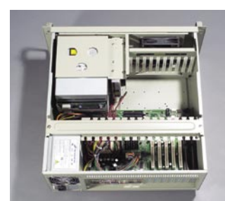
Motherboard can fit in 450 mm (17.7") depth