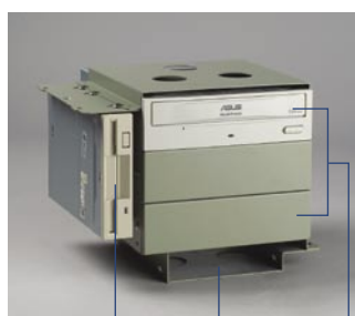
One 3.5" drive bay Three 5.25" drive bays One internal 3.5" drive bay space

easy-to-maintain cooling fan System reset switch