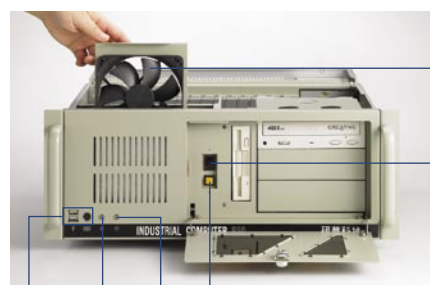
HDD LED Power switch USB & PS/2 Power LED

easy-to-maintain cooling fan System reset switch