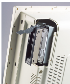
Removable 3.5" HDD bay