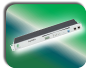
Digi Remote Power Manager