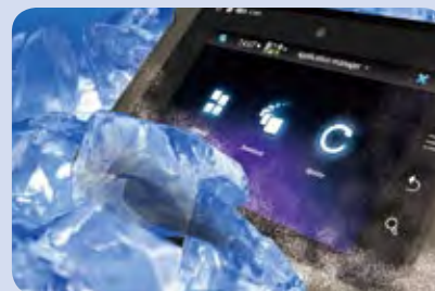
Operating Temperature Protection against extreme temperatures.