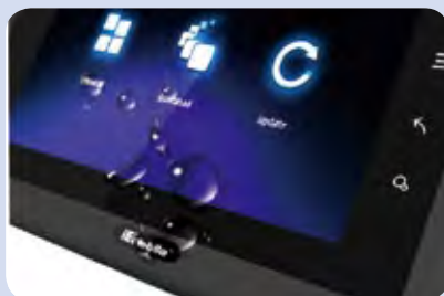
IP Grade Protection against dust and water splash.