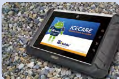
Drop Survival Protection against accidental drops.