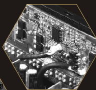
Patented DC connector Module