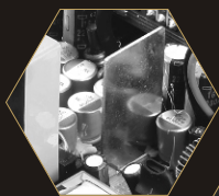
High Quality 105°C E-Cap