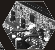
Patented DC connector Module