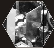
High Quality 105°C E-Cap