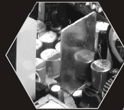
High Quality 105°C E-Cap