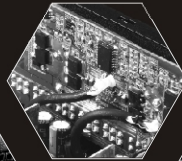
Patented DC connector Module