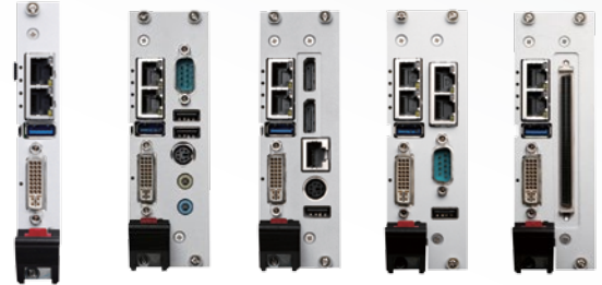
cPCI-3510 cPCI-3510D cPCI-3510G cPCI-3510L cPCI-3510M