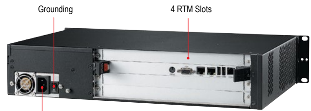
300 W 1U ATX PSU with AC Inlet and Power Switch