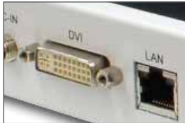
The built-in mono hybrid DVI display output grants SI-06 wide connectivity through CRT, DVI and HDMI(with audio).