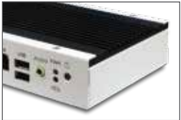
Compact chassis with fanless, ruggedized design allows SI-06 to fit into a wide variety of digital signage applications.