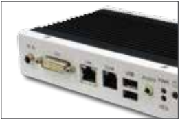
Built-in with Mini PCI-E expansion slot, SI-06 supports optional features such as Wi-Fi, Bluetooth, TV Tuner/3G Wireless connectivity