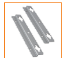
Wall Mount bracket