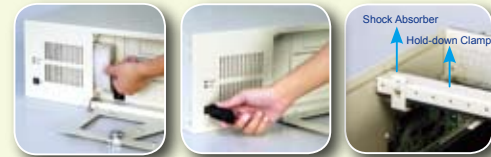
Replaceable Fan Filter