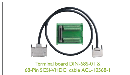
Terminal board DIN-68S-01 & 68-Pin SCSI-VHDCI cable ACL-10568-1