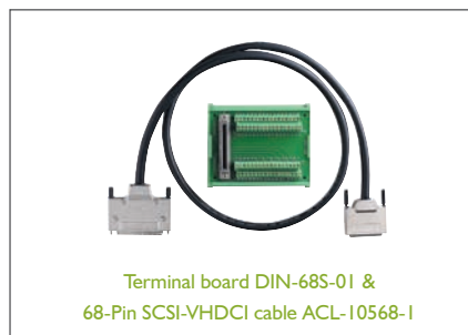
Terminal board DIN-68S-01 & 68-Pin SCSI-VHDCI cable ACL-10568-1