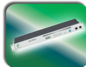
Digi Remote Power Manager