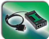
Digi Passport® I-KVM