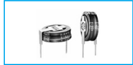
Marking color : White print on an indigo sleeve