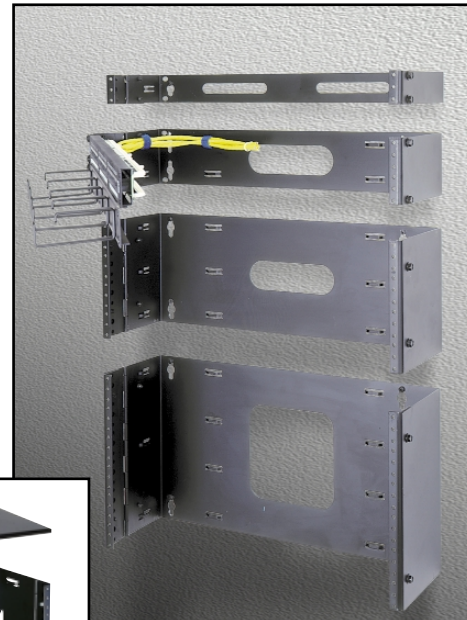
HPM-1 HPM-2 HPM-4 HPM-6