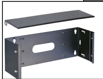
HPM shown with optional top cover

HINGED PANEL ACCESSORIES TOP DUST COVER/MODEM SHELF